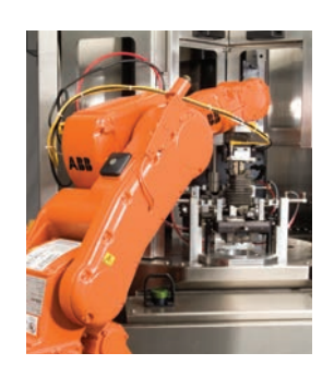
A TWO-AXIS OR MULTI-AXIS SERVO ROBOT CAN BE INTEGRATED INTO A SUNNEN MODULAR SYSTEM.

Our automation options are designed to increase the operational efficiency of your precision system. They shorten cycle times, increase tool life, and – most importantly – radically reduce labor costs. Sunnen automation solutions can keep your system running 24 hours a day, seven days a week.