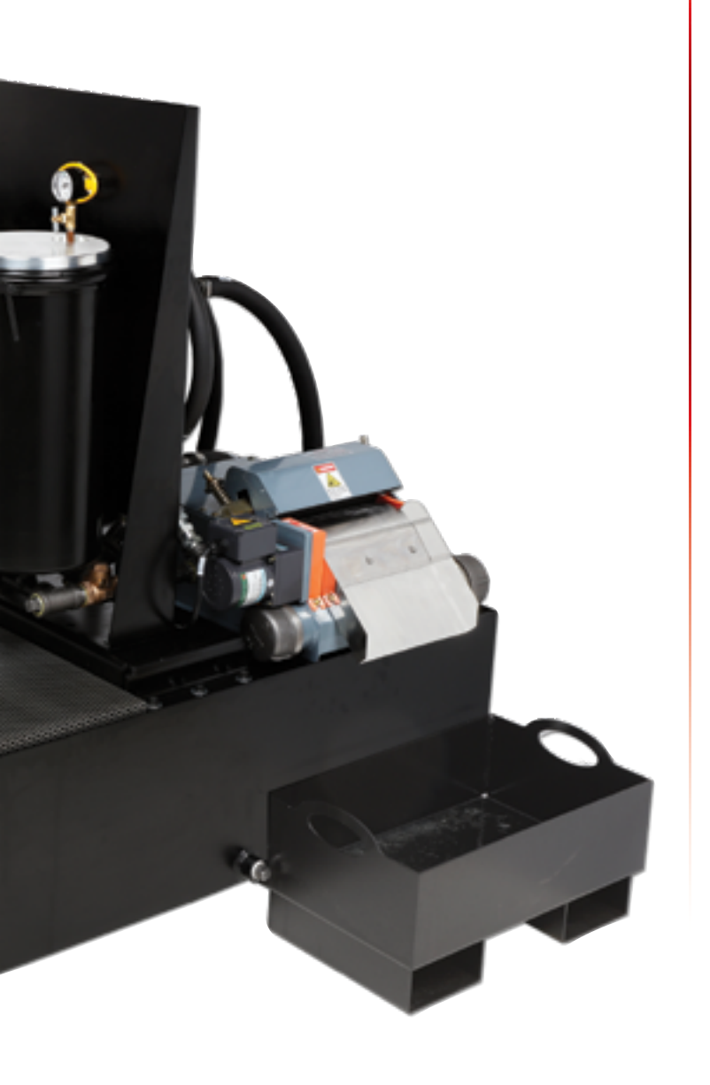
416-liter (110-gallon) Grit Guard Coolant pictured. 208-liter (55-gallon) unit is pictured on the front.