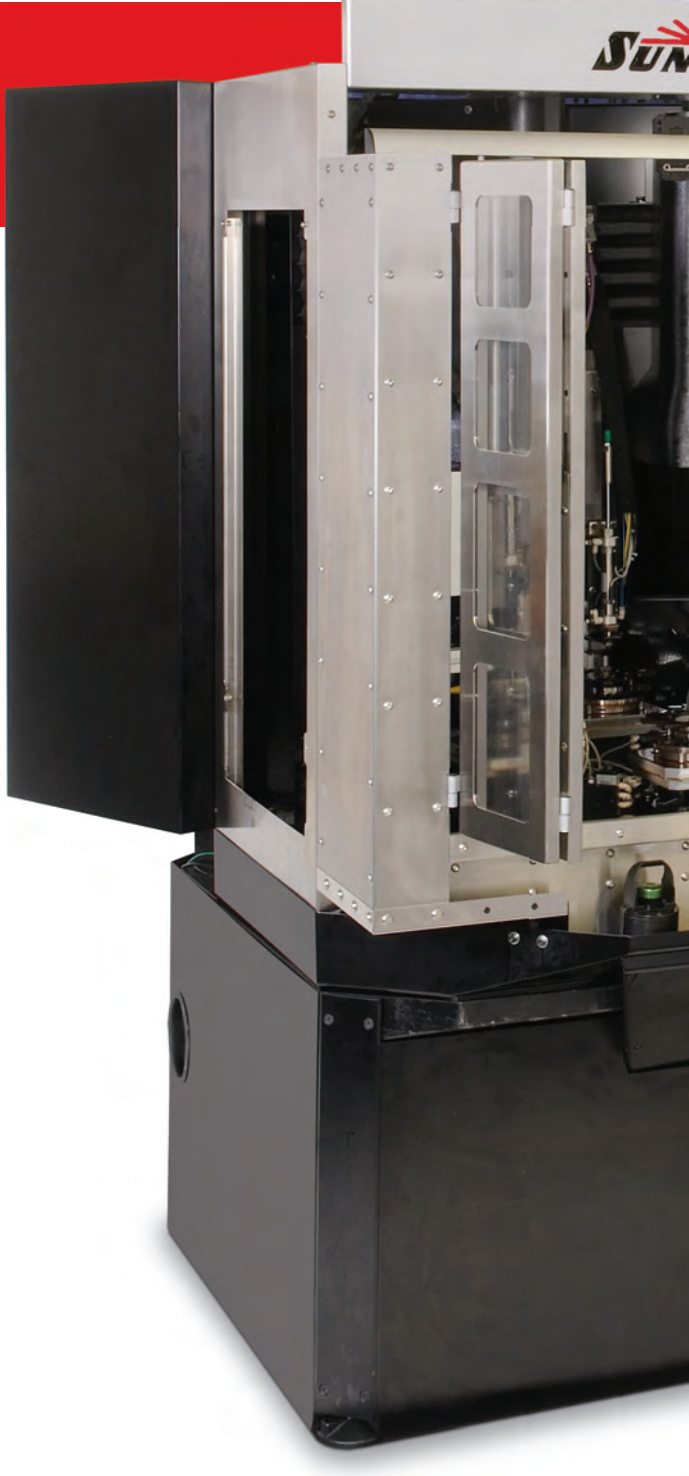
CUSTOM ROBOTIC PARTS HANDLING