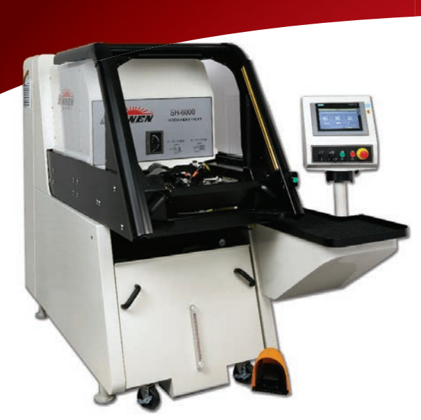
SH-6000 KROSSGRINDING® SYSTEM

Sunnen's SH-6000 builds on the 25-year heritage of the successful high precision CGM and KGM series KROSSGRINDING® machines. Simply stated, the SH-6000 takes precision honing to the next level. Both high speed and high torque models are available to replace existing CGM/KGM models.