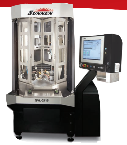
SVL-2115 LAPPING SYSTEM

Sunnen's SVL-2115 automated lapping machines bring increased safety, productivity, and part consistency to what is traditionally a manual process. The SVL-2115 is based on the same machine platform as the proven SV-2100 honing system and provides single setup processing of aerospace hydraulic control valve sleeves, fuel system components and other parts that are prone to distortion when honed.